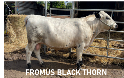
FROMUS BLACK THORN

FROMUS HERD Bull Fromus Black Thorn, born Oct 2022 and sired by Woodbastwick Drakkar (EX92). Shown at both the South Suffolk and Royal Norfolk shows in 2024, Black Thorn is well-handled and is ready to go to work. Phil Baskett, Suffolk 07908 925856 philbaskett@btinternet.com