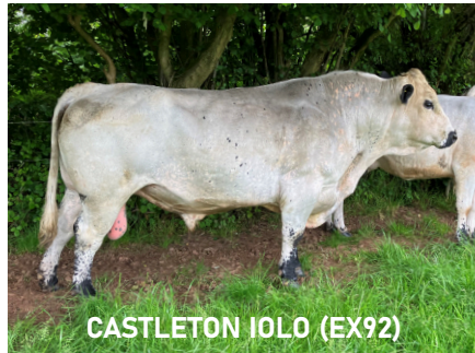
CASTLETON IOLO (EX92)