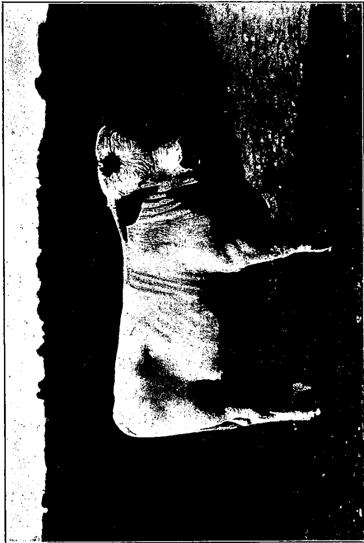
WOBURN MATTHIAS II.