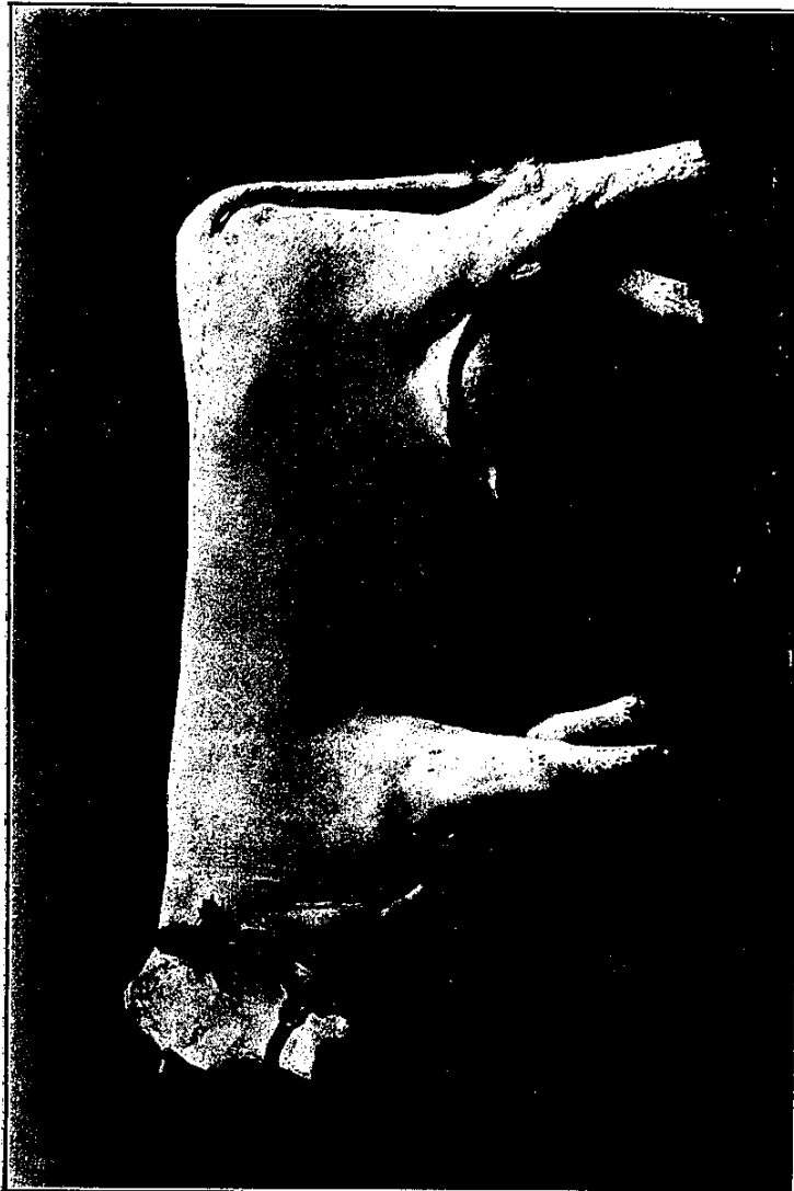
BAWDESWELL SPIRAEA 538.