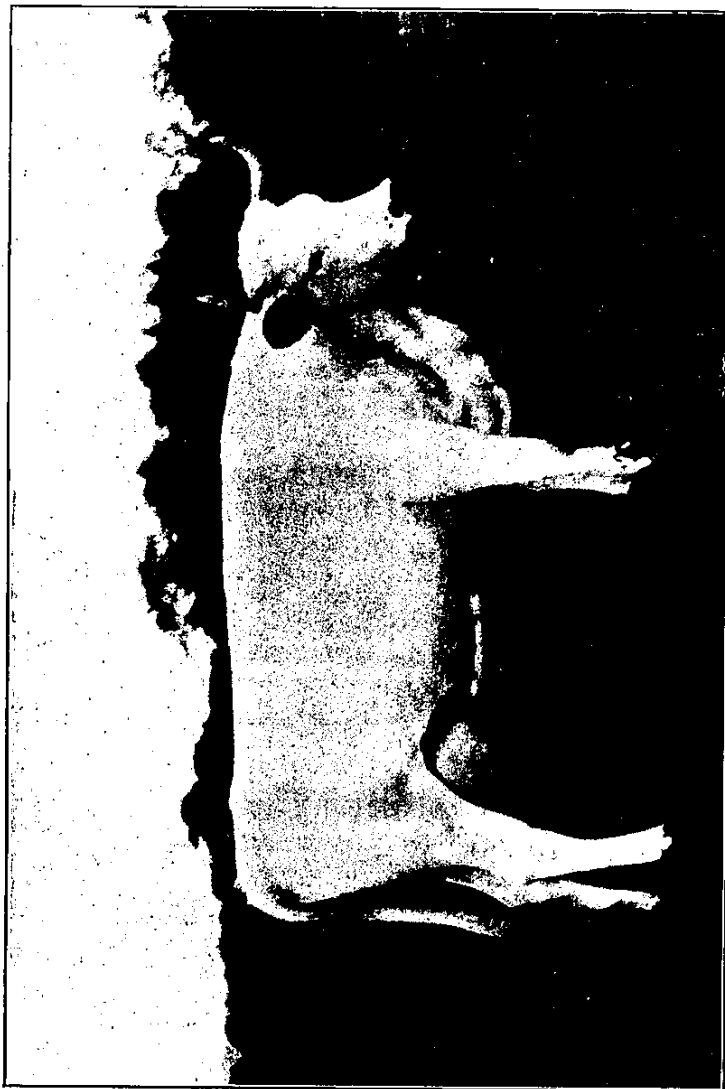
Park Cow, FAYGATE GARTER 68.

Sire , Solva Snowstorm 79, Dam , Dynevor Fuchsia 420.